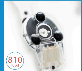
810 nm near infrared light LED